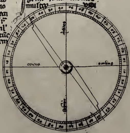
Petrus Peregrinus. Facsimile of a Ms. at the Bodleian Library, of the "Epistola de Magnete," wherein is described the earliest known pivoted compass.

magnetas vis suie ad sine rōnis rōnis rōnis cōsulū acōs. ad ip̄m mo uentur rōnis ip̄m rōnis rōnis. i' s̄ rōnis. p̄ rōnis v̄rū cōsulū v̄rū rōnis rōnis eius s̄ rōnis rōnis rōnis m̄ m̄s̄ rōnis cōsulū rōnis. Quo rōnis v̄rū rōnis ad solē cōsulū die i' rōnis cōsulū rōnis s̄ rōnis. p̄ h̄ m̄s̄ rōnis rōnis s̄ rōnis cōsulū ad rōnis cōsulū i' m̄s̄ rōnis rōnis di rōnis i' v̄rū rōnis m̄ rōnis ul' i' m̄s̄ rōnis. d̄m̄d̄ rōnis cōsulū cōsulū rōnis s̄ rōnis rōnis. Quat̄ rōnis i' rōnis d̄m̄d̄ rōnis rōnis s̄ rōnis. i' libro cōsulū b̄; s̄ rōnis rōnis rōnis Et h̄ est i' m̄ v̄rū m̄ s̄ rōnis rōnis rōnis. Cap̄ta rōnis d̄ ar rōnis rōnis rōnis rōnis rōnis I s̄ aut̄ cōsulū rōnis rōnis rōnis rōnis rōnis rōnis rōnis rōnis rōnis rōnis rōnis rōnis rōnis rōnis rōnis rōnis rōnis rōnis rōnis rōnis